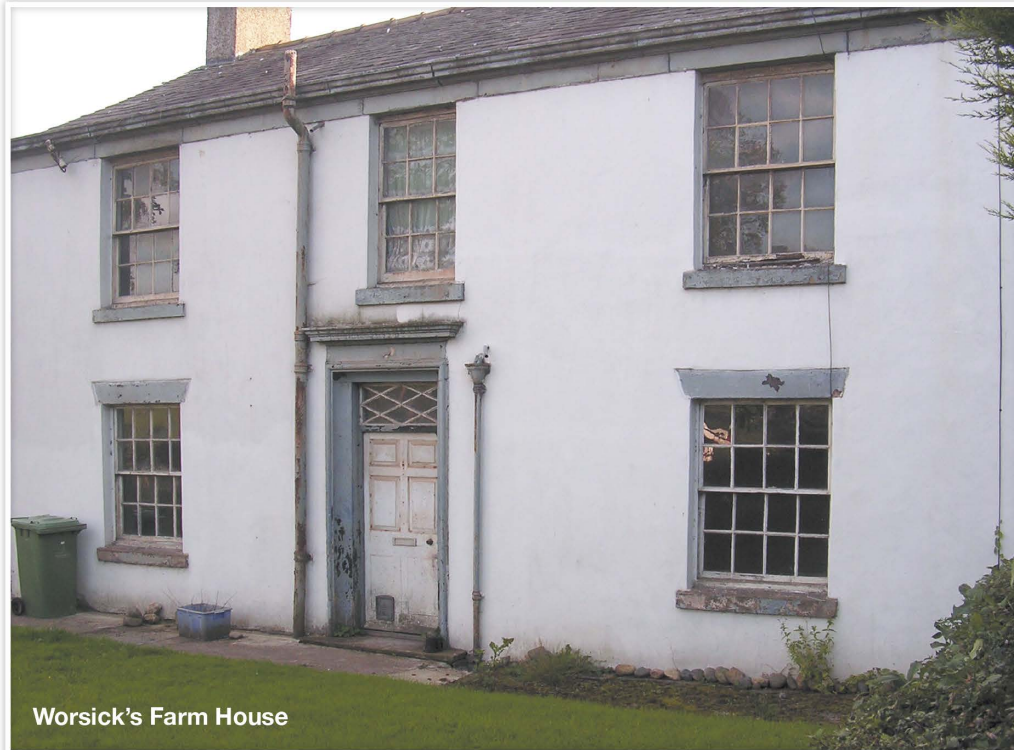
Worsick's Farm House